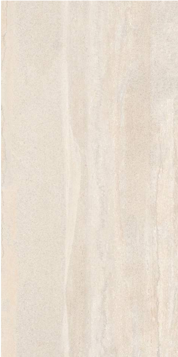
AVORIO (Ivory) Vein-cut Matte Finish; 9 mm thickness 60x120 cm (24"x48") TS.PT.AVO.2448.VC