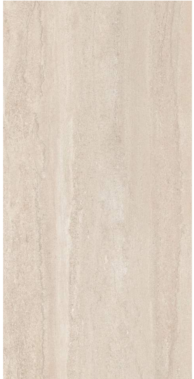
BEIGE Vein-cut Matte Finish; 9 mm thickness 60x120 cm (24"x48") TS.PT.BGE.2448.VC

All items shown in this document are part of Olympia's stocking program. For special orders, please contact your Olympia Tile Sales Representative.