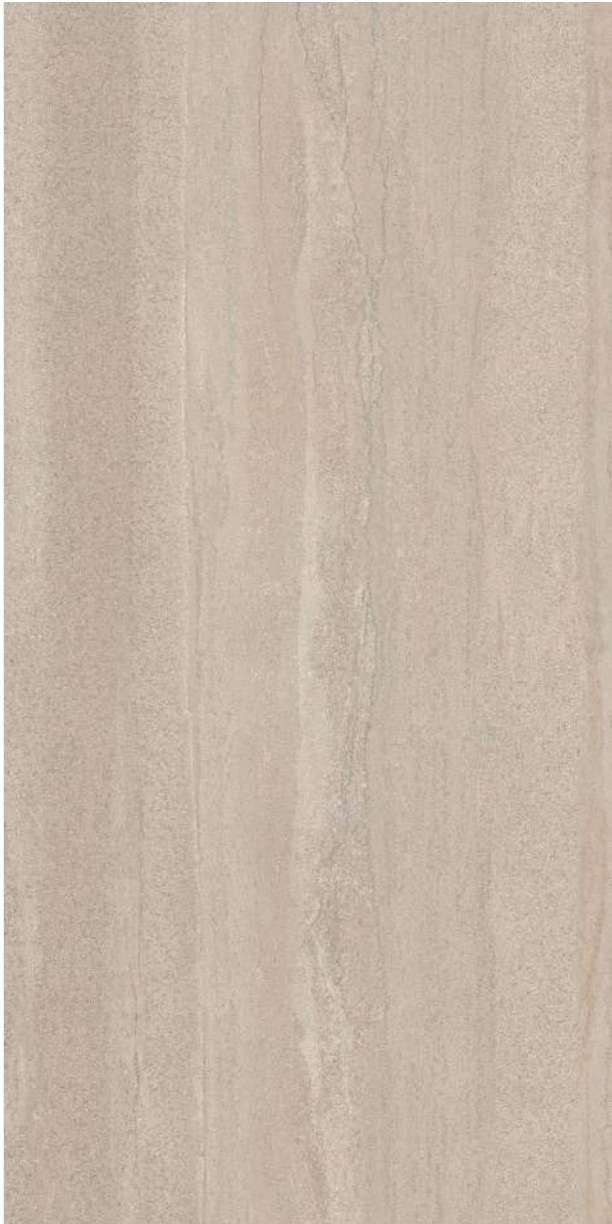
TAUPE Vein-cut Matte Finish; 9 mm thickness 60x120 cm (24"x48") TS.PT.TPE.2448.VC