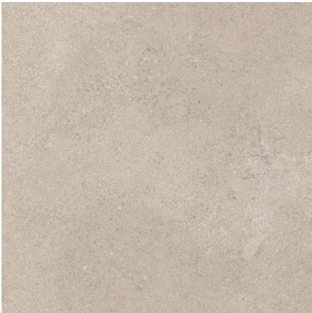
TAUPE Cross-cut Matte Finish; 9 mm thickness 60x60 cm (24"x24") TS.PT.TPE.2424.CC