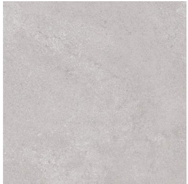
GRIGIO (Grey) Cross-cut Matte Finish; 9 mm thickness 60x60 cm (24"x24") TS.PT.GRG.2424.CC

All items shown in this document are part of Olympia's stocking program. For special orders, please contact your Olympia Tile Sales Representative.