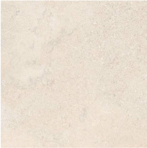
AVORIO (Ivory) Cross-cut Matte Finish; 9 mm thickness 60x60 cm (24"x24") TS.PT.AVO.2424.CC