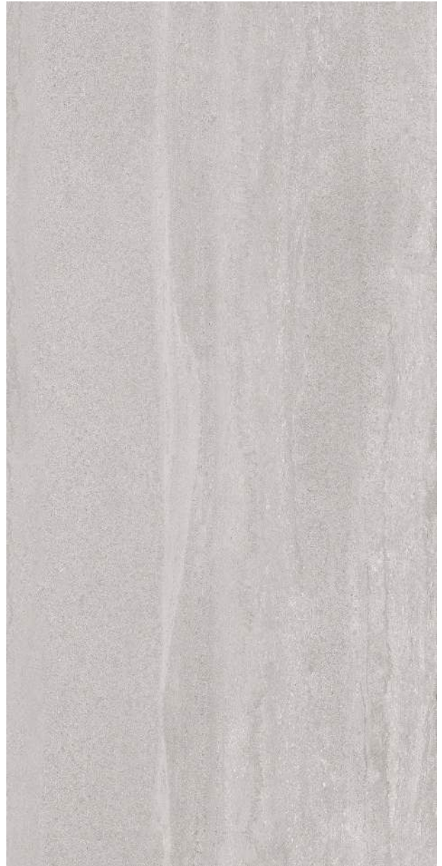
GRIGIO (Grey) Vein-cut Matte Finish; 9 mm thickness 60x120 cm (24"x48") TS.PT.GRG.2448.VC

All items shown in this document are part of Olympia's stocking program. For special orders, please contact your Olympia Tile Sales Representative.