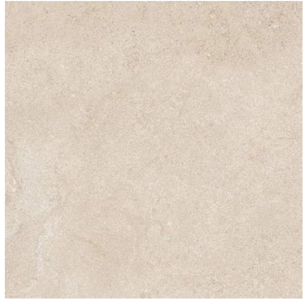
BEIGE Cross-cut Matte Finish; 9 mm thickness 60x60 cm (24"x24") TS.PT.BGE.2424.CC