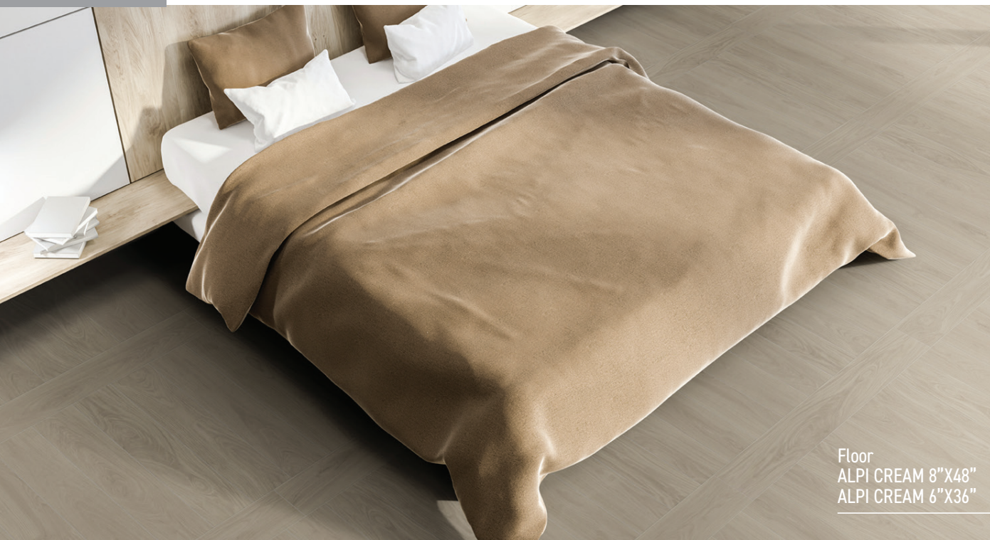
Floor ALPI CREAM 8"X48" ALPI CREAM 6"X36"