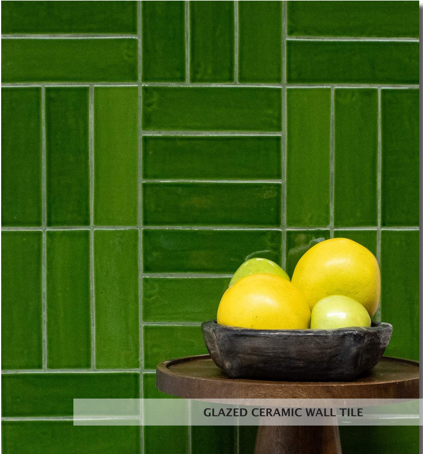
GLAZED CERAMIC WALL TILE

Introducing the Tantalize Collection, where a vibrant palette of 10 captivating colors invites you to embark on a journey of creativity. Each hue tells its own unique story, beckoning you to explore a world where imagination knows no bounds. Awaken your senses as you immerse yourself in a symphony of shades, igniting inspiration and pushing your designs to new heights.