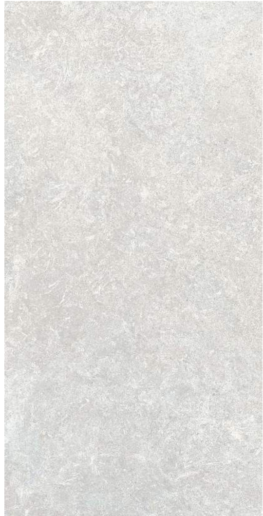
PEARL Matte Finish

30 x 60 cm (12" x 24") Thickness: 9mm UE.KR.WHT.1224