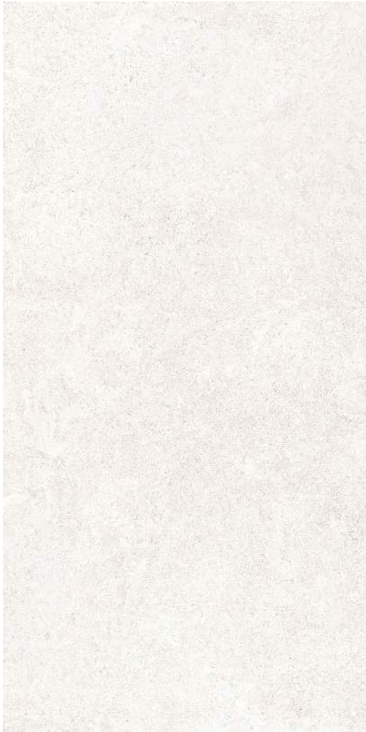
WHITE Matte Finish

30 x 60 cm (12" x 24") Thickness: 9mm UE.KR.WHT.1224