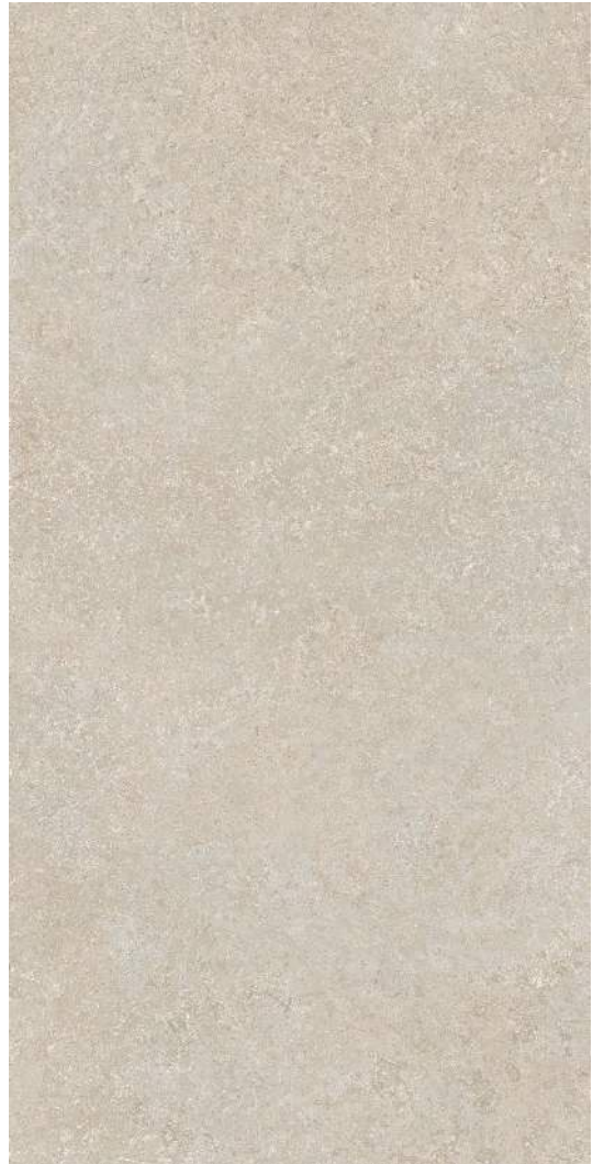
SAND Matte Finish

30 x 60 cm (12" x 24") Thickness: 9mm UE.KR.IVO.1224