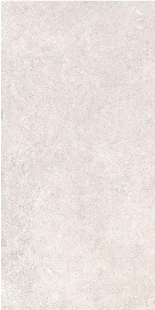
IVORY Matte Finish

30 x 60 cm (12" x 24") Thickness: 9mm UE.KR.IVO.1224