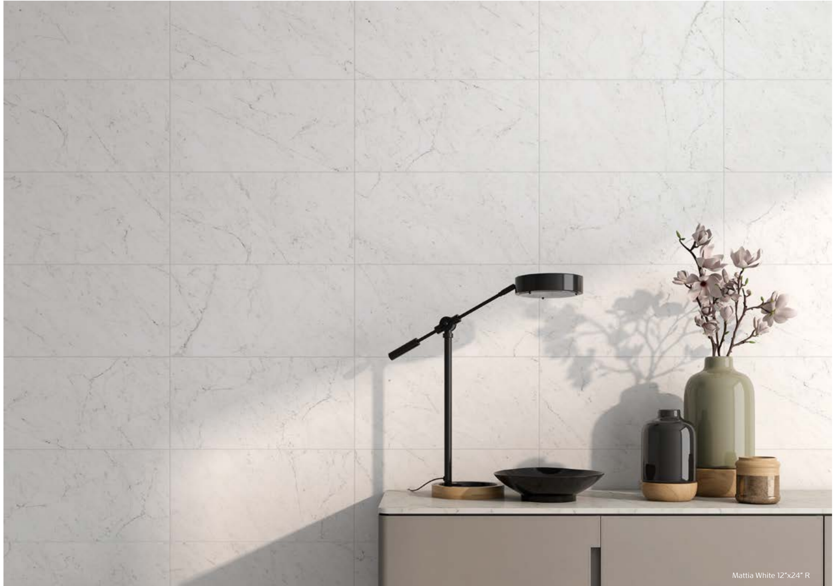
Mattia White 12"x24" R