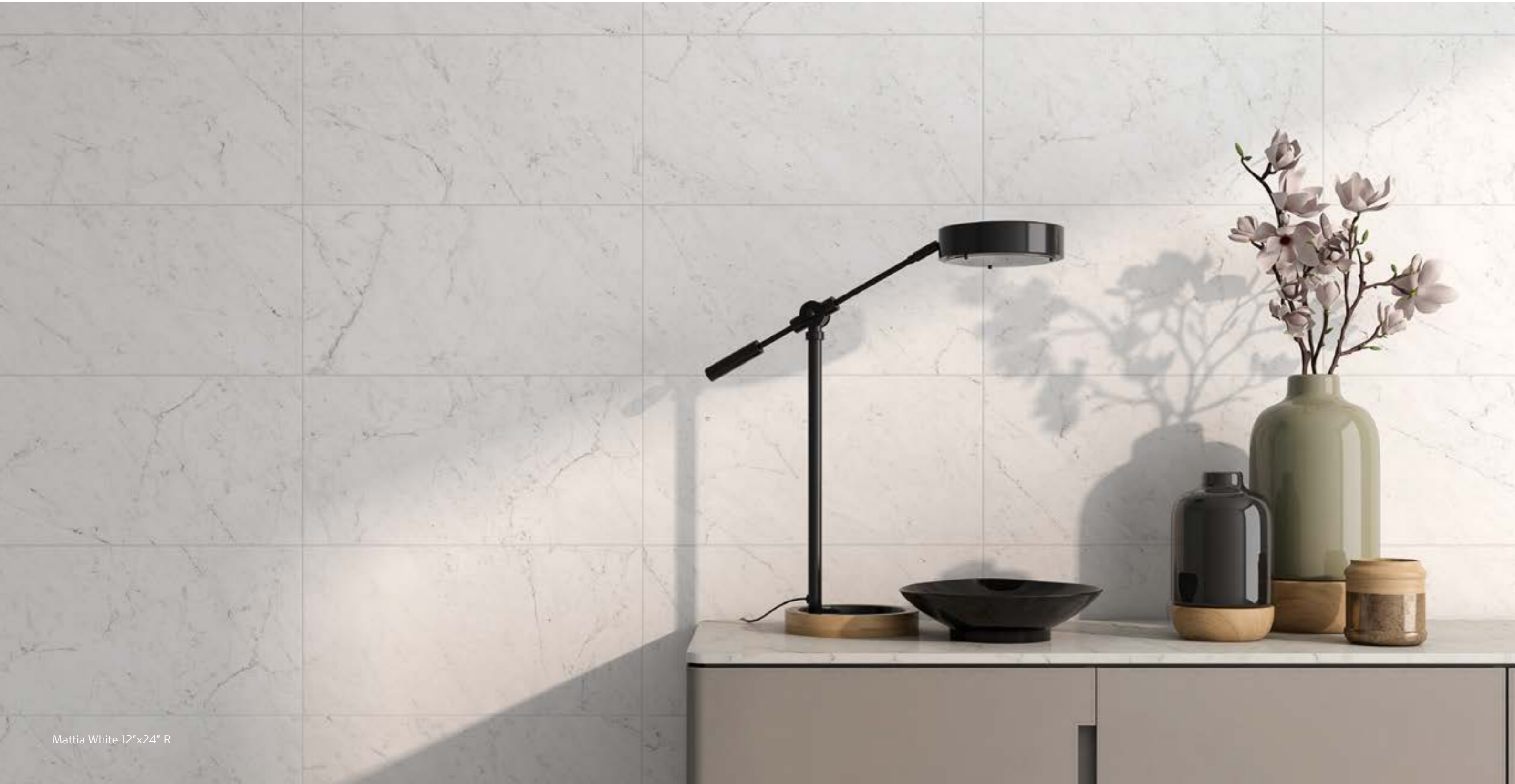
Mattia White 12"x24" R

The brilliance of marble is captured in this stunning tile collection, which radiates sophistication and elegance. Whether you prefer a polished or matte finish, each tile features a distinct marble-inspired design that replicates the natural beauty and uniqueness of these stones. With a vast array of options to choose from, this collection caters to every taste and style.