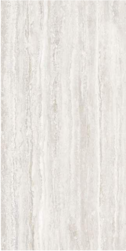
BIANCO 30 x 60 cm (12" x 24") Matte Finish KJ.TR.BIA.1224