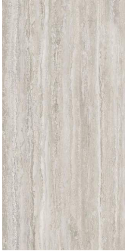
ARGENTO 30 x 60 cm (12" x 24") Matte Finish KJ.TR.ARG.1224