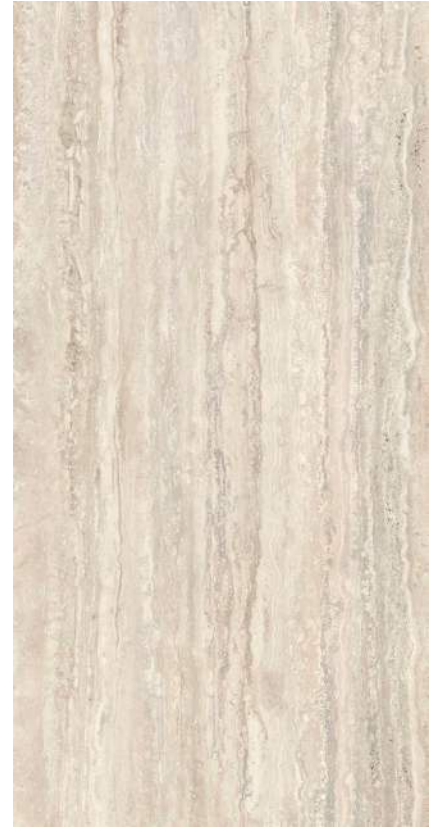
CREMA 30 x 60 cm (12" x 24") Matte Finish KJ.TR.CRM.1224

All items shown in this document are part of Olympia's stocking program. For special orders, please contact your Olympia Tile Sales Representative.