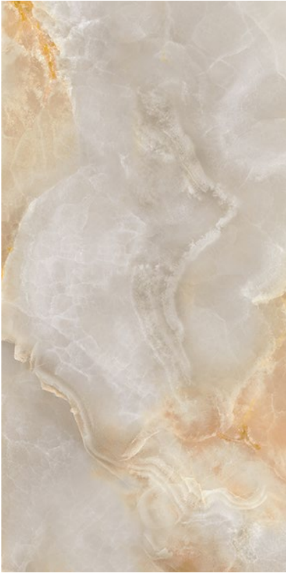
CLOUD GREY (White/Grey) 74 x 148 cm (29" x 58") Polished Finish OE.UC.CLD.3060.PL

89 x 89 cm (35" x 35") Polished Finish OE.UC.CLD.3535.PL