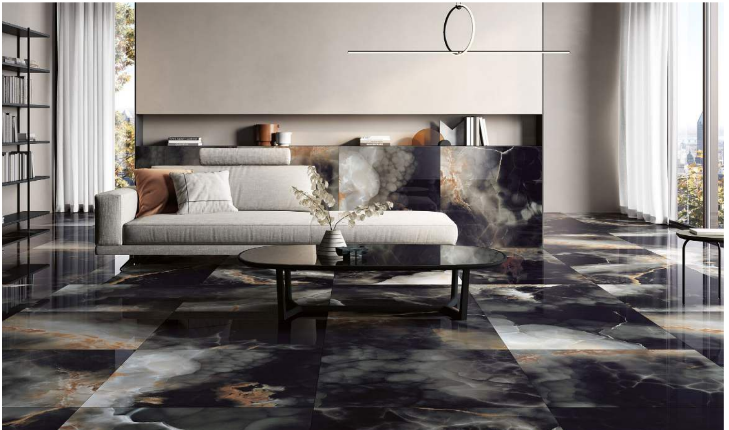
DEEP DARK (Black)