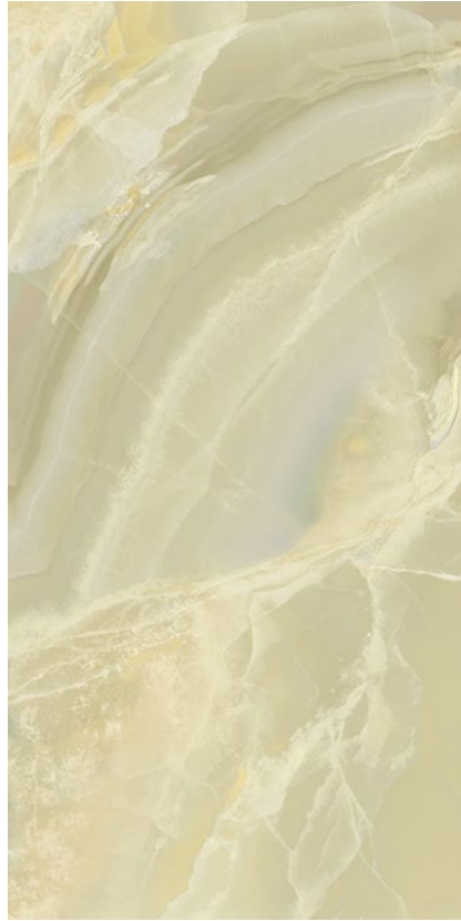
GREEN 74 x 148 cm (29" x 58") Polished Finish OE.UC.GRN.3060.PL

89 x 89 cm (35" x 35") Polished Finish OE.UC.CLD.3535.PL