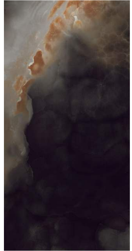
DEEP DARK (Black) 74 x 148 cm (29" x 58") Polished Finish OE.UC.DEP.3060.PL

89 x 89 cm (35" x 35") Polished Finish OE.UC.GRN.3535.PL