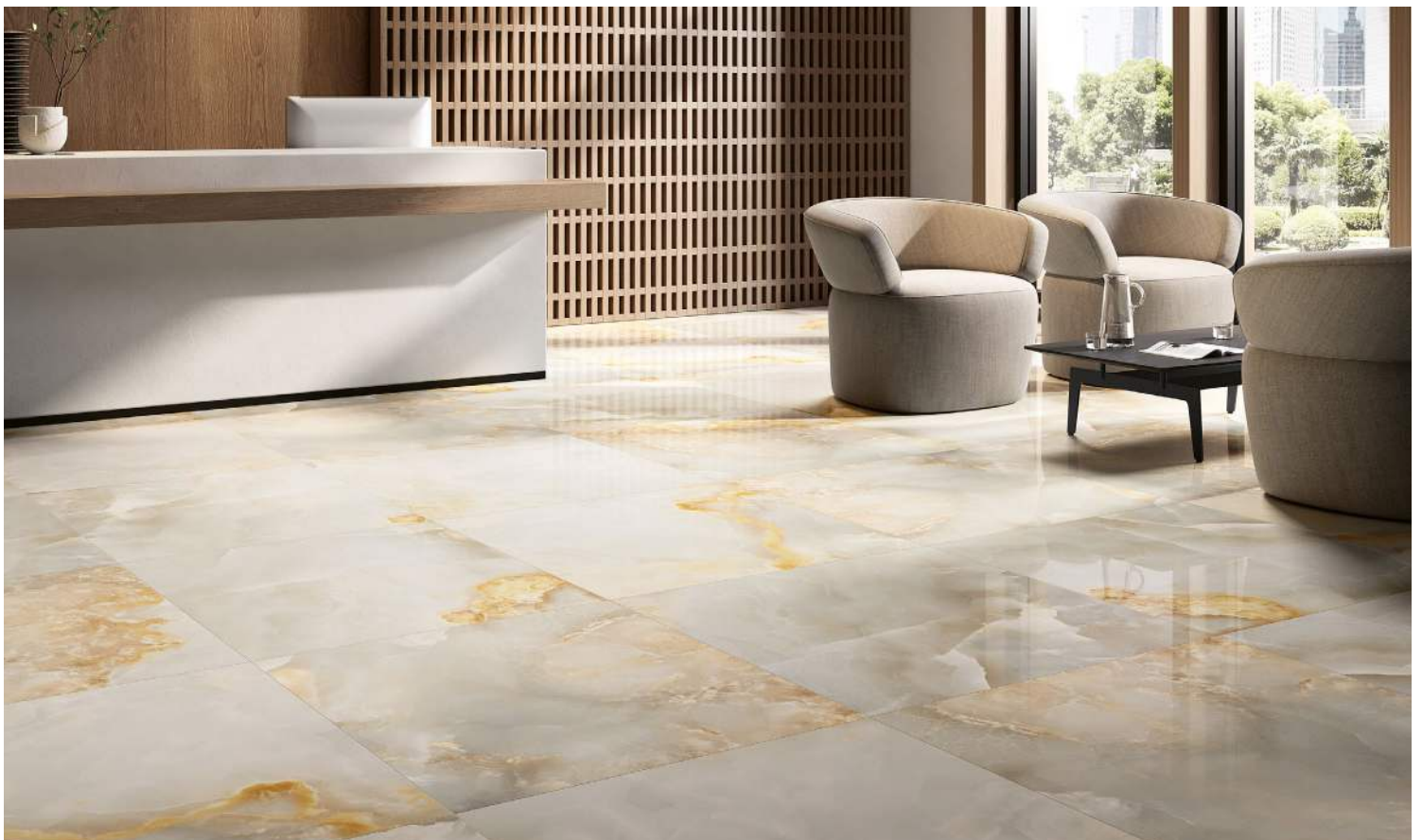
CLOUD GREY (White/Grey)