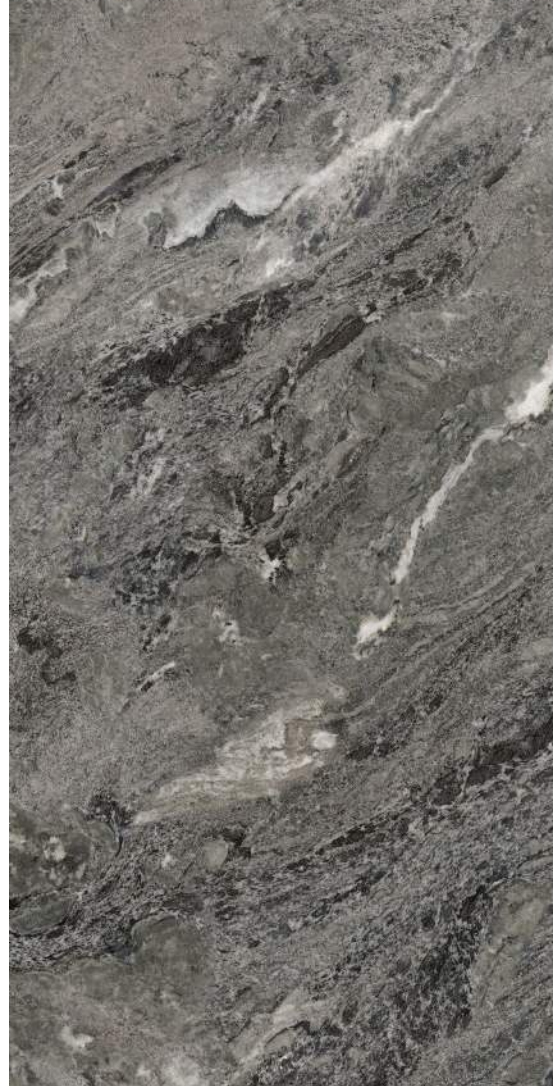
SPACE Brushed Finish

60 x 120 cm (24" x 48") BC.CO.HVN.2448.BD