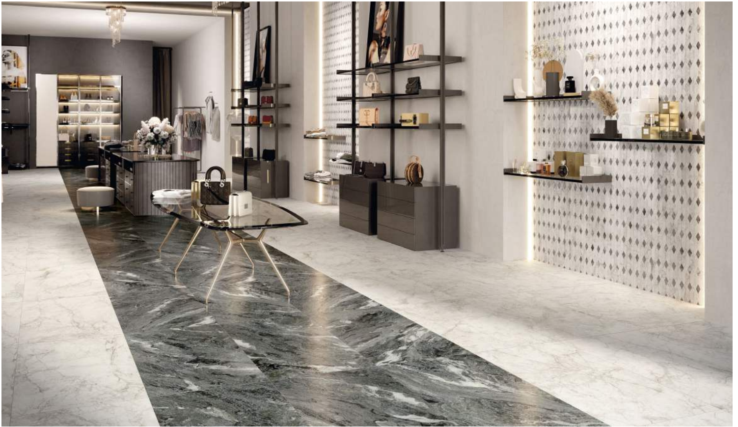
WHITE STONE & SPACE