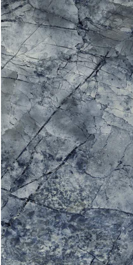
HEAVEN Brushed Finish

60 x 60 cm (24" x 24") BC.CO.HVN.2424.BD