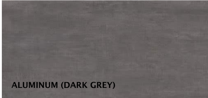
ALUMINUM (DARK GREY)