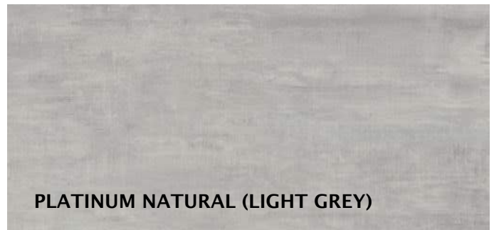
PLATINUM NATURAL (LIGHT GREY)