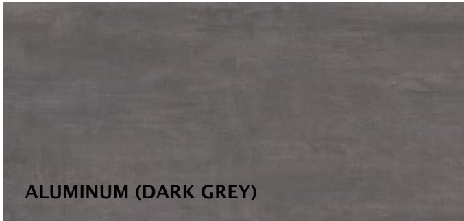
ALUMINUM (DARK GREY)