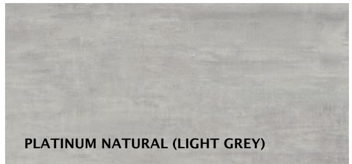
PLATINUM NATURAL (LIGHT GREY)