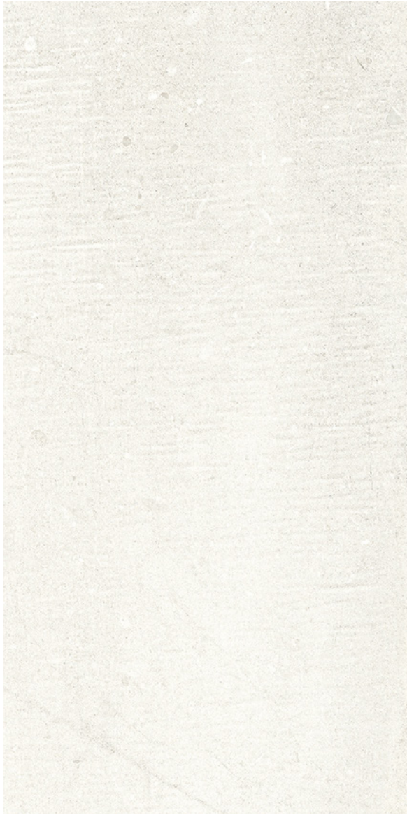
60 x 120 cm (24 x 48) BC.UT.SGH.2448.MT