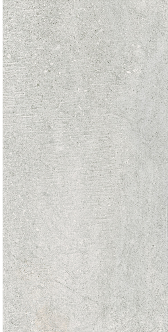
60 x 120 cm (24 x 48) BC.UT.MHT.2448.MT

All items shown in this document are part of Olympia's stocking program. For special orders, please contact your Olympia Tile Sales Representative.