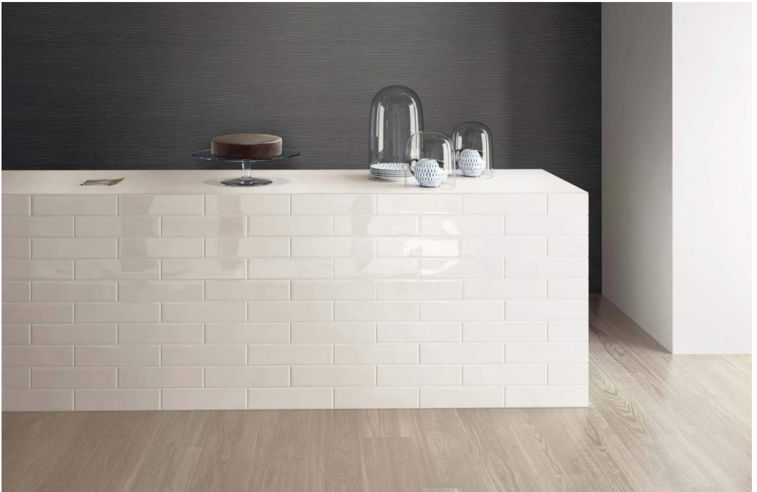
LIGHT (Off White)