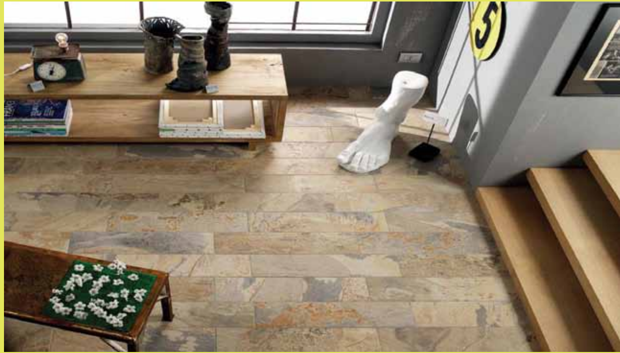
Slatey is a new line from Edimax that uses dual-process, cutting edge technology to create a porcelain tile that absolutely recreates the look of natural slate. Available in three colorways, Ochre, Almond & Multi IN 12x12, 18x18, 6x24, 2x2 mosaic and coordinating battiscopa.