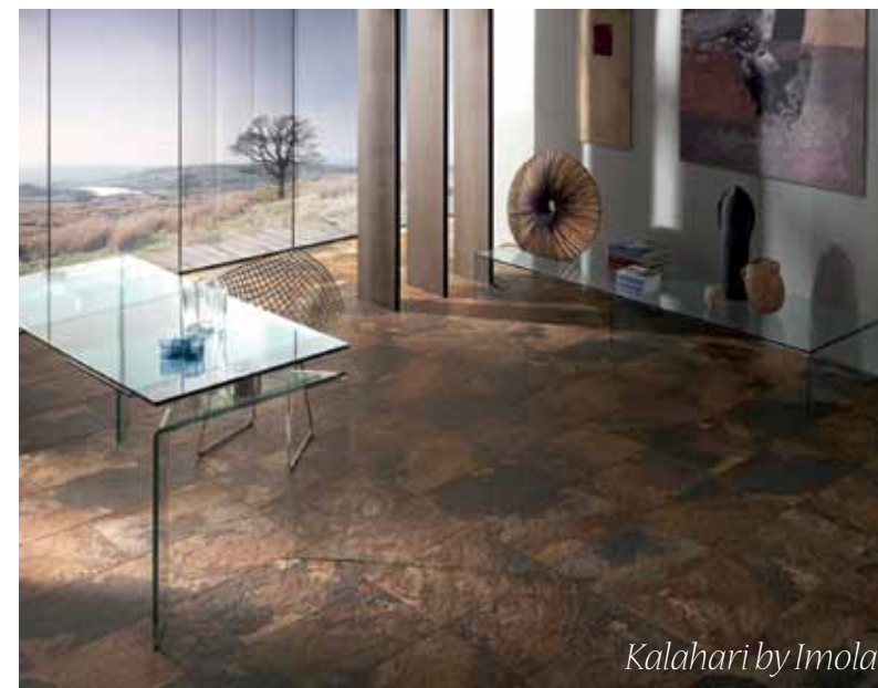
Kalahari

Read this newsletter online at: www.katelotile.com/review/